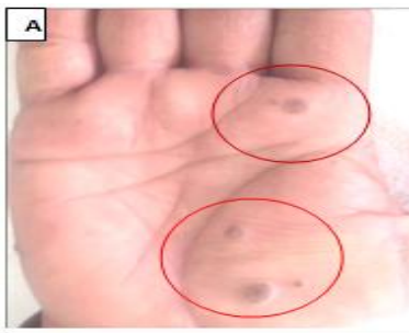
Fig A- 1 st Visit: Week 0,