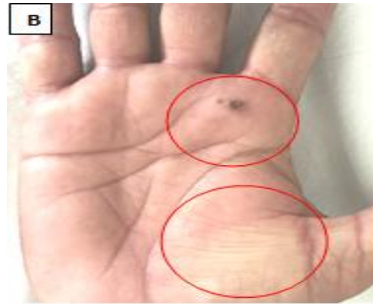
Fig B- 2 nd Visit: Week 3,