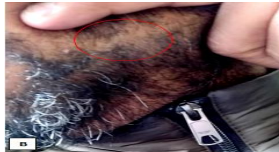
Fig B- 2 nd Visit: Week 3, Complete Response