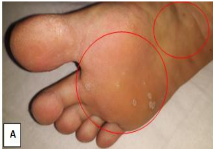
Fig A- 1 st Visit: Week 0