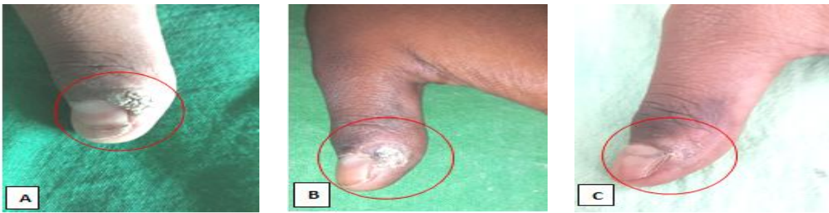
Fig A- 1 st Visit: Week 0, Fig B- 2 nd Visit: Week 3, Black eschar formed after injection, Fig C- 3 rd Visit: Week 6, Complete Response with P.I.H.