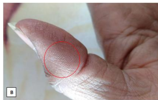
Fig B- 2 nd visit: Week 3, Complete