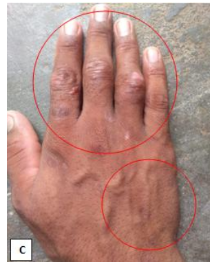
Fig C- 3 rd Visit: Week 6