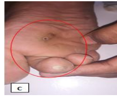
Fig C- 3 rd Visit: Week 6, Complete Response