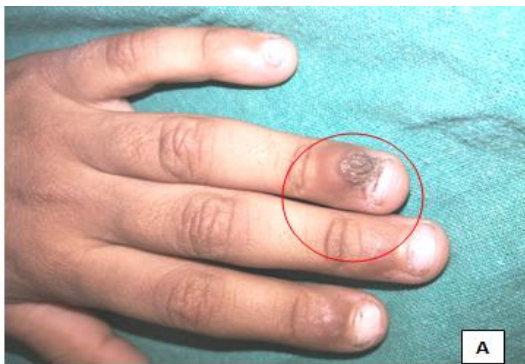
Fig A- 1 st Visit: Week 0,