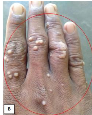
Fig B- 2 nd visit: Week 3