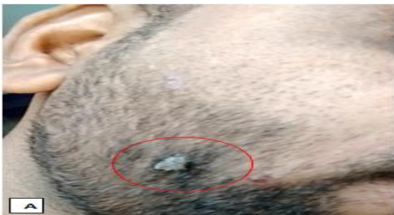
Fig A -1 st Visit: Week 0,