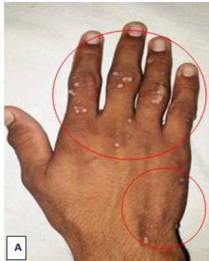
Fig A-1 st visit: Week 0