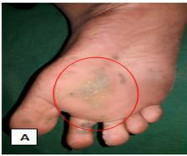
Fig A- 1 st Visit: Week 0,