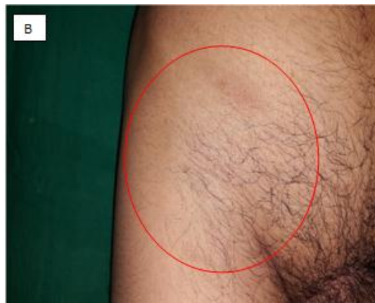
Fig B-2 nd Visit: Week 3, Complete Response