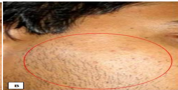
Fig B- 2 nd Visit: Week 12, Complete and Partial Response