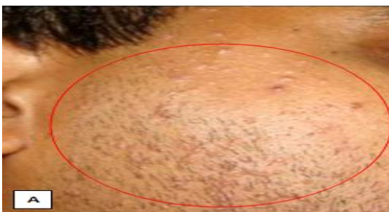
Fig A- 1 st Visit: Week 0,