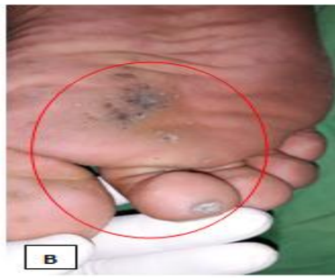
Fig B- 2 nd Visit: Week 3, Black Eschar,