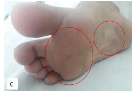
Fig C- 3 rd Visit: Week 6, Complete Response