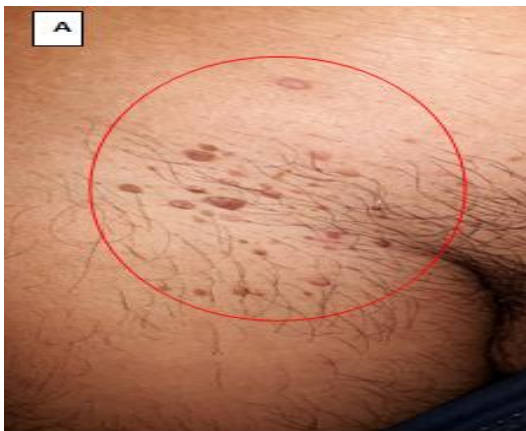
Fig A-1 st Visit: Week,