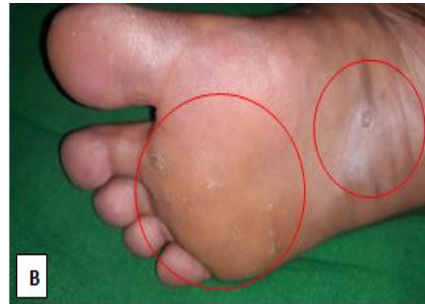
Fig B- 2 nd Visit: Week 3