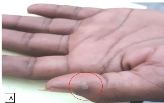
Fig A- 1 st Visit: Week 0