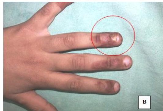
Fig B- 2 nd Visit: Week 3