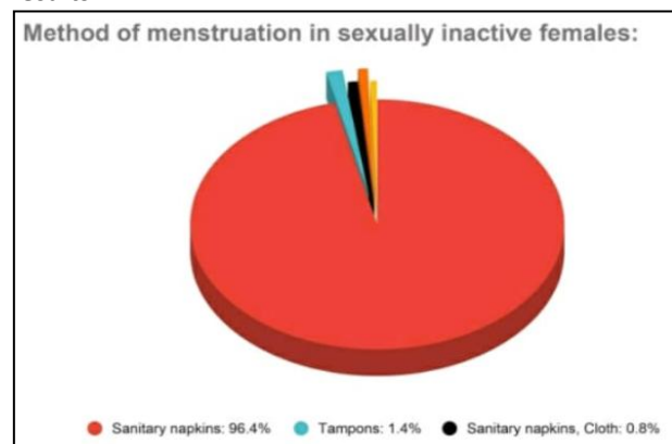
Figure 1: Pie chart demonstrating method of menstruation in sexually inactive females belonging to reproductive age group. Vast majority of females [96.4%] are shown to use sanitary napkins. 1.4% of them use tampons. 0.8% still uses cloth. Various reasons were told about not using menstrual