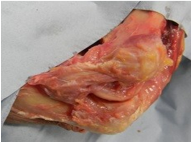
Figure 1: Cadaveric dissection of medial collateral ligament (anterior band).

posterior oblique ligament (POL) and the transverse ligament (TL) also known as Coopers ligament [4]. The AOL Fig. (1) originates from the anterior inferior surface of the medial epicondyle of the humerus [5] and inserts into the medial margin of the coronoid process approximately 18mm distal to coronoid tip on the sublime tubercle [6, 7]. The POL also originates from the medial epicondyle and then diverges posteriorly to insert on the medial side of the olecranon with the TL passing between the ulna attachments of the AOL and POL. The AOL is the strongest and most important medial stabilising structure consisting of anterior and posterior bands [8].