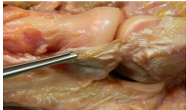
Figure 2: Cadaveric dissection of lateral ulnar collateral ligament.

ligaments are often referred to as the lateral collateral ligament complex. These three elements provide varus and posterolateral rotatory stability of the elbow and the proximal radioulnar joint. The LUCL Fig. (2) principally acts to ensure posterolateral rotatory stability, incompetence of which results in chronic elbow instability [3, 12]. The LUCL crosses the inferior aspect of the radial head with its origin and insertion at the lateral epicondyle of the humerus and the supinator crest of the ulna respectively [8]. The AL stabilizes the proximal radioulnar joint from its insertion and origin at the sigmoid notch of the ulna allowing it to hook around the radial neck. The LRCL originates from the lateral epicondyle of the humerus runs anteriorly to the LUCL and inserts into the AL.