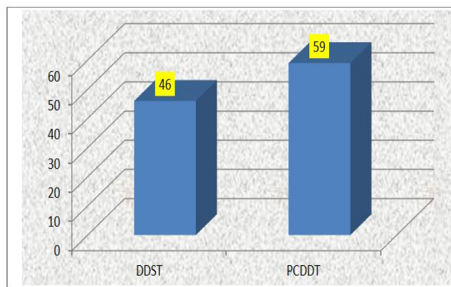
Figure 1: Comparison of ESBL detection method

By double disc synergy test (DDST) 45.54% (46) of Klebsiella pneumoniae isolates were ESBL producers, while PCDDT detected 58.41% (59) Klebsiella pneumoniae isolates as ESBL producers (p value<0.05) [ Fig.-1 ].