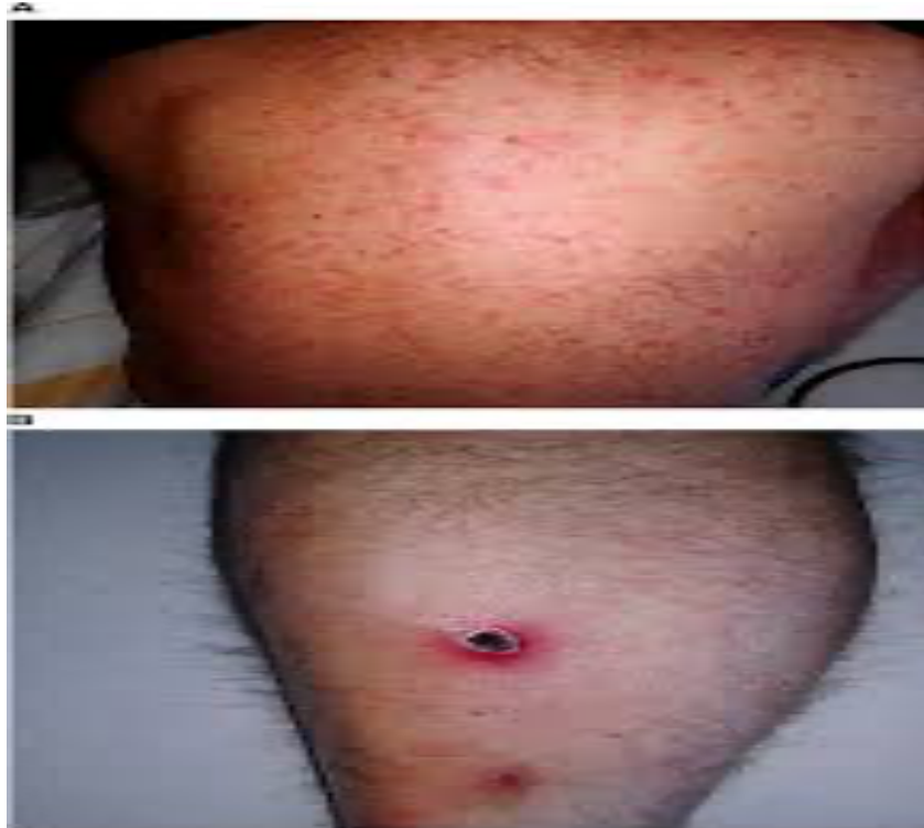
Figure 1: Centrifugal macular rash on the trunk & typical eschar at site of inoculation