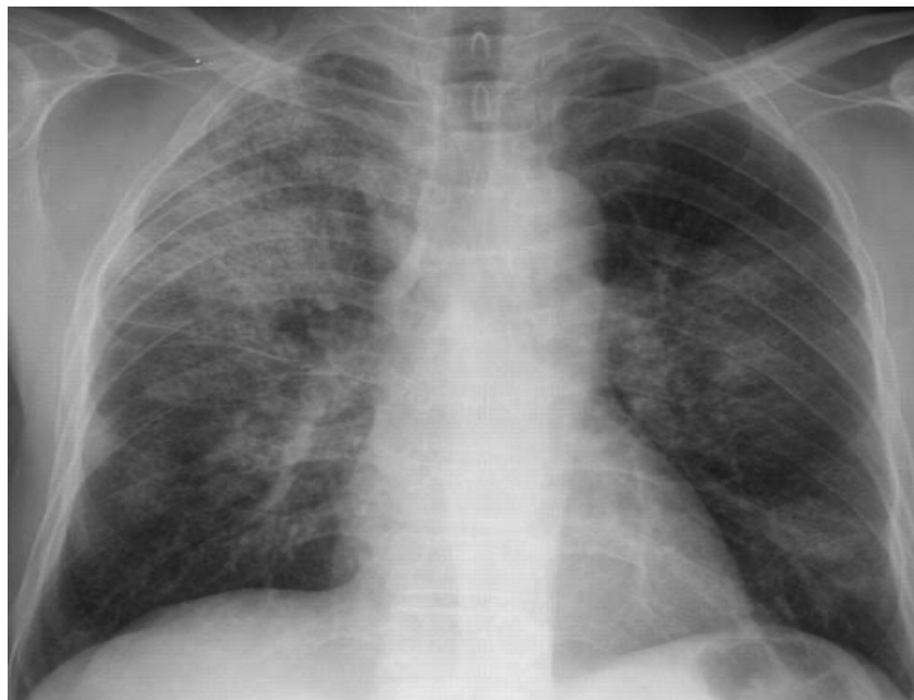
Figure 2: X-ray chest showing bilateral infiltration