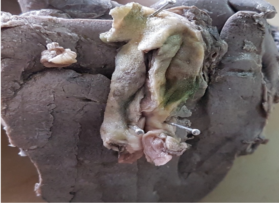
Figure 1: Gross specimen of Gall Bladder is unremarkable