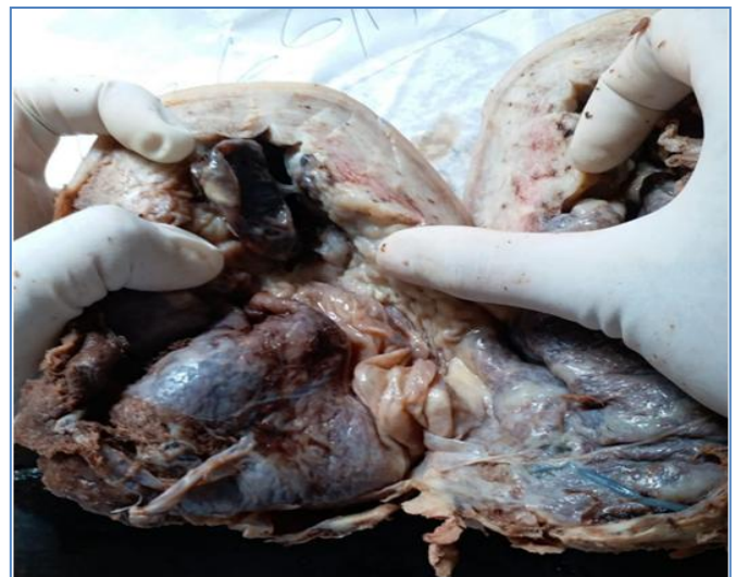
Figure 2: Gross picture of Uterus showing adherent Placenta.